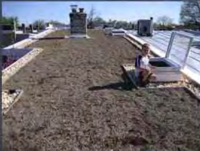
3 Weeks old