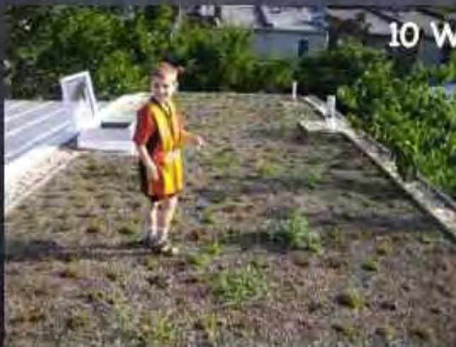
10 Weeks old