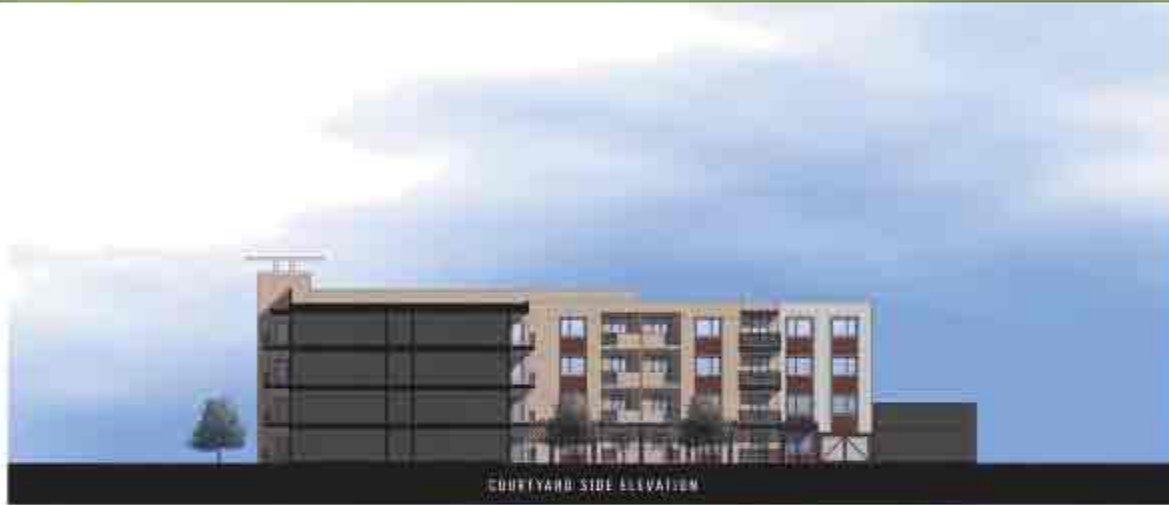
COURTYARD SIDE ELEVATION

FOUNDATION Building Affordable Healthy Homes