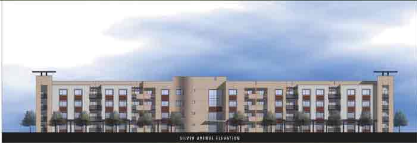
SILVER AVENUE ELEVATION

FOUNDATION Building Affordable Healthy Homes