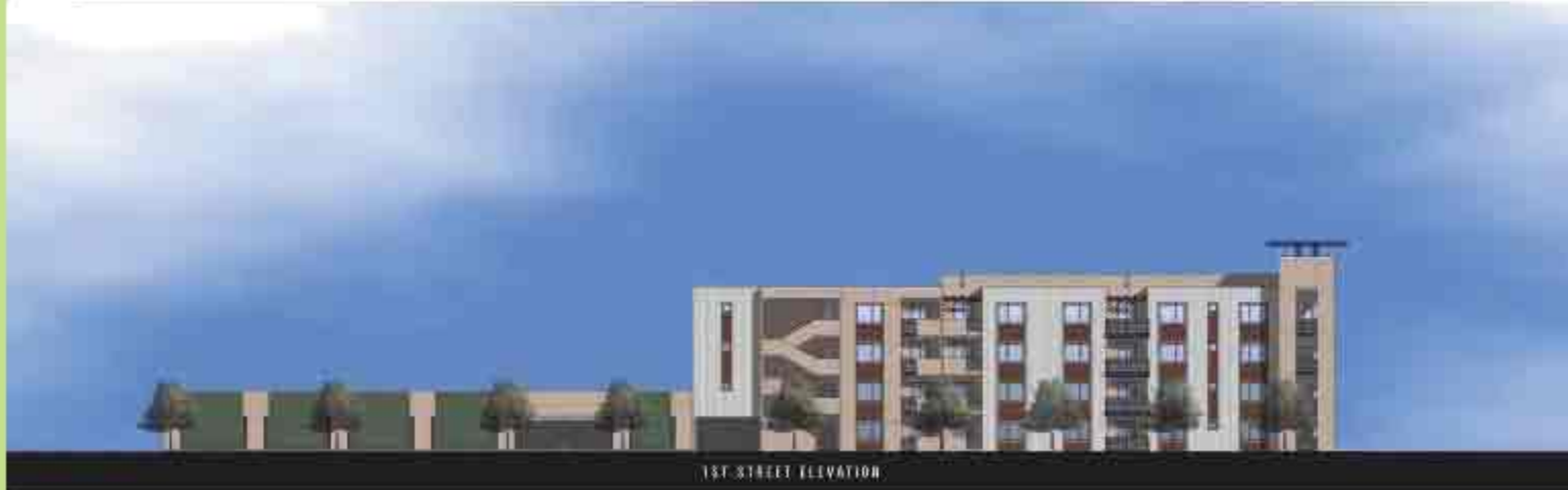
1ST STREET ELEVATION