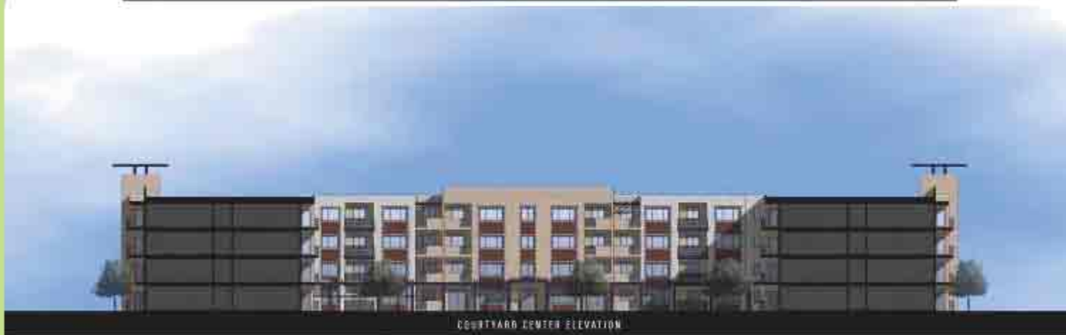
COURTYARD CENTER ELEVATION